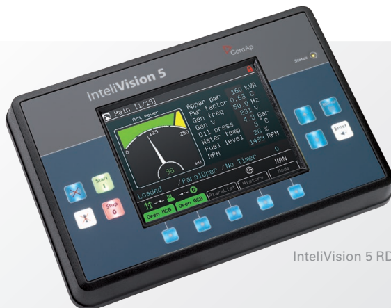
InteliVision 5 RD